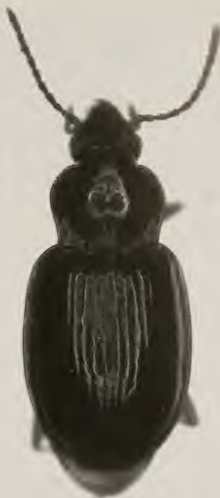
Fig. 1. Tachys fortestriatus , spec. nov. Habitus. Length: 2.8 mm.

Up to now this species was recorded from Barrington Tops and New England Tableland, both